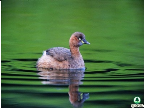
Little Grebe Tachybaptus ruficollis