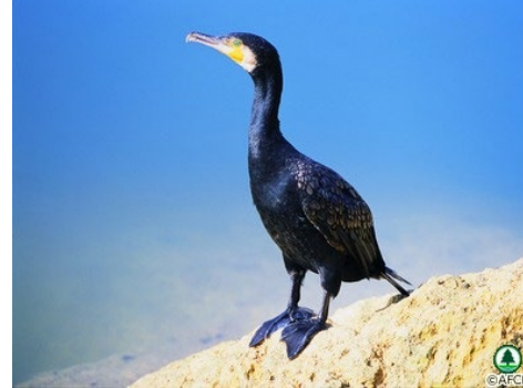
Great Cormorant Phalacrocorax carbo