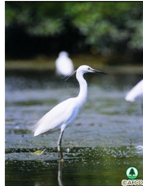
Little Egret Egretta garzetta