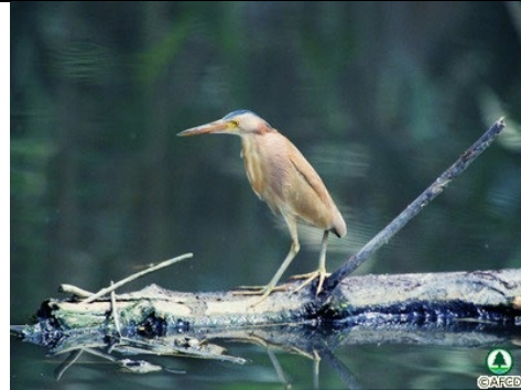
Yellow Bittern Ixobrychus sinensis