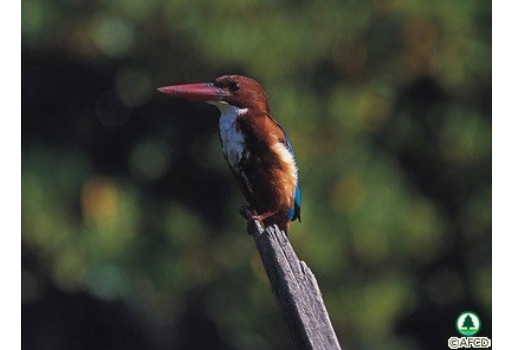
White-throated Kingfisher Halcyon smyrnensis