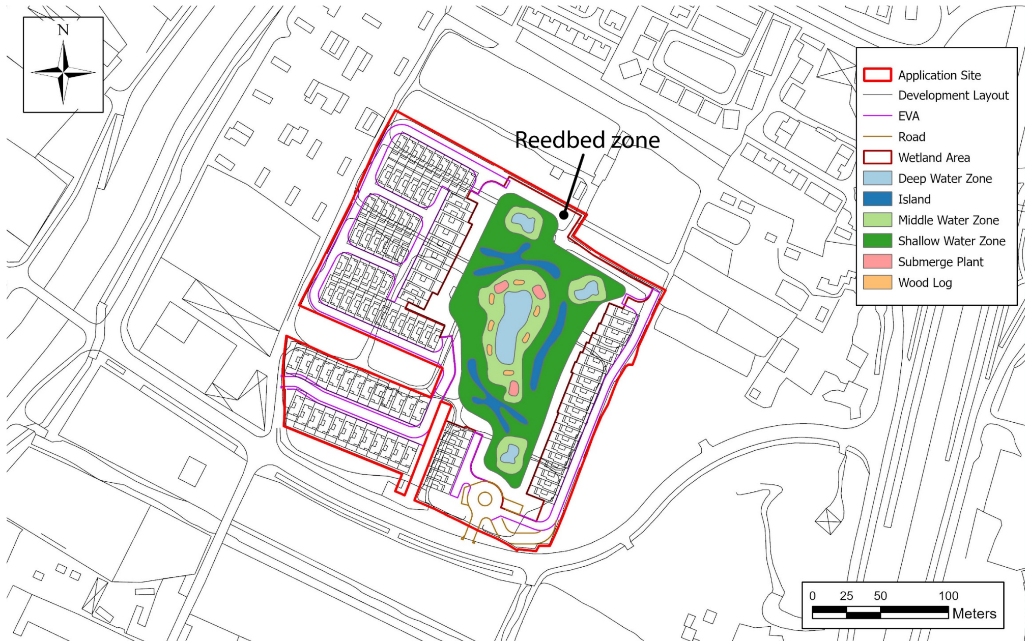
Figure 4.1 Configuration details of the proposed wetland and the building layout