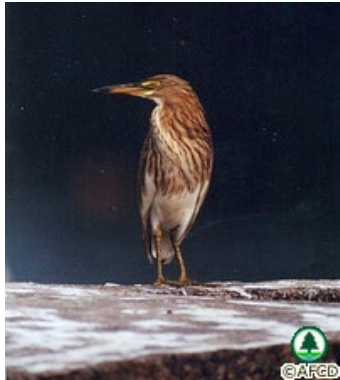
Chinese Pond Heron Ardeola bacchus