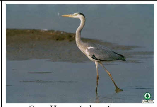
Grey Heron Ardea cinerea