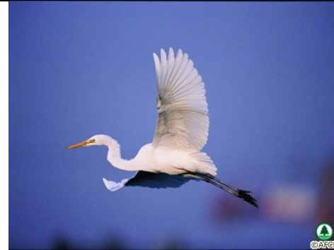
Great Egret Ardea alba